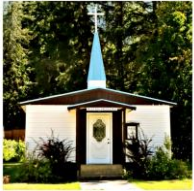
Most Holy Redeemer Riondel