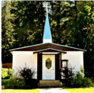
Most Holy Redeemer Riondel