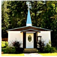
Most Holy Redeemer Riondel